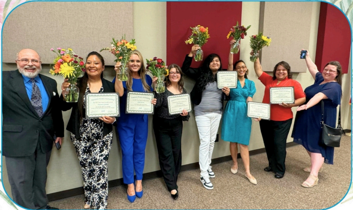
Congratulations to our scholarship recipients!