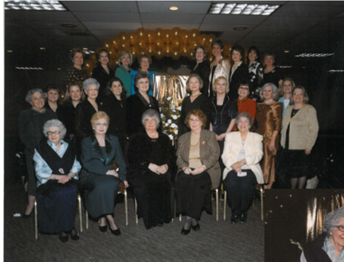
EWI of Tulsa 50th Anniversary