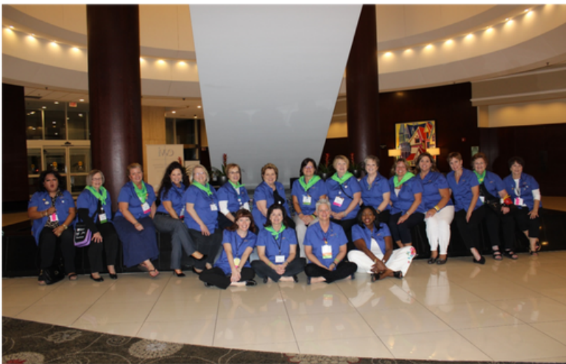
LCAM 2015 Tulsa, OK