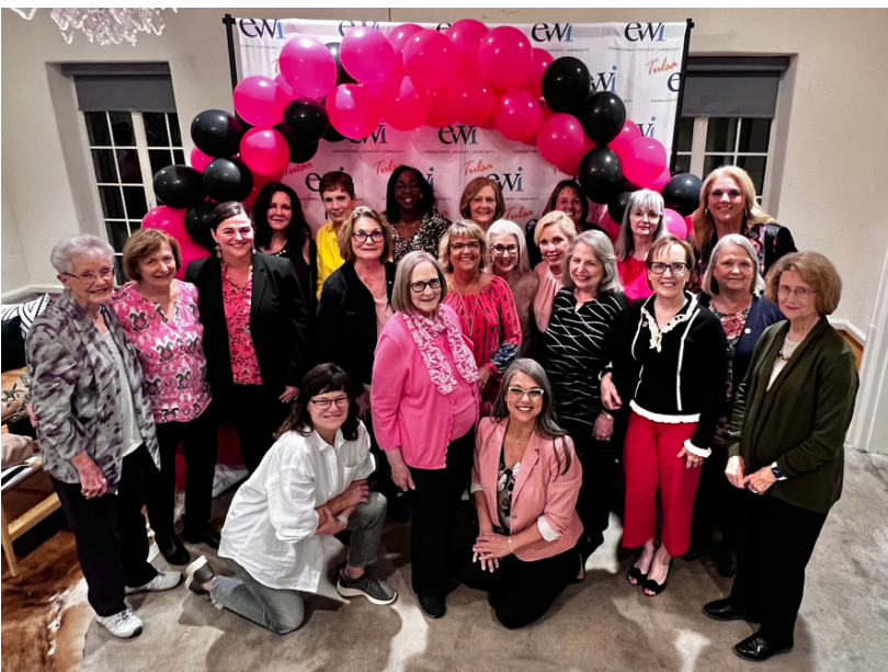
EWI Tulsa Chapter Past Presidents