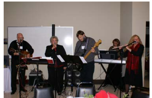
New Beginnings Church Band