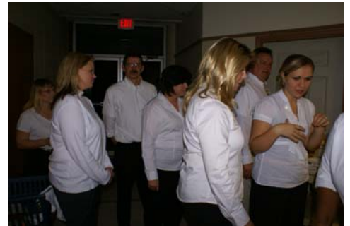
Gatesway personnel as our servers