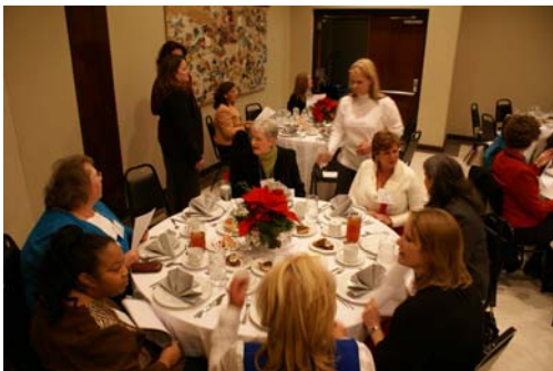
Wonderful fellowship in a festive setting!