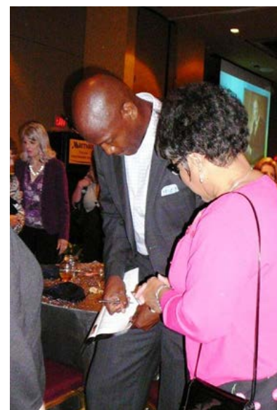
Taking time for an autograph.