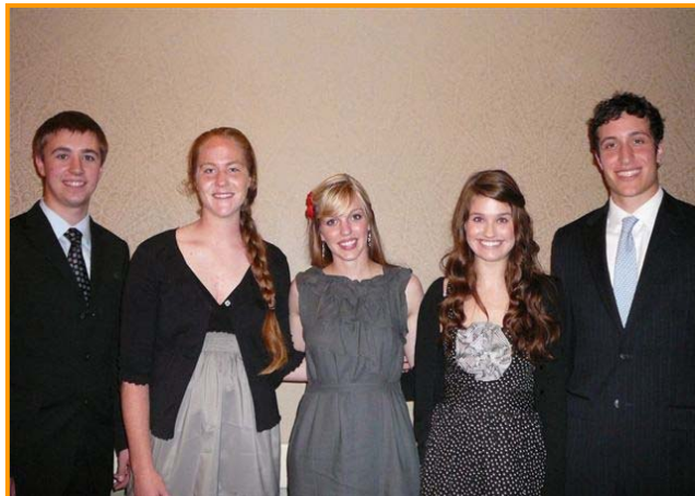
The 2011 EWISP Winners (pictured from left to right):