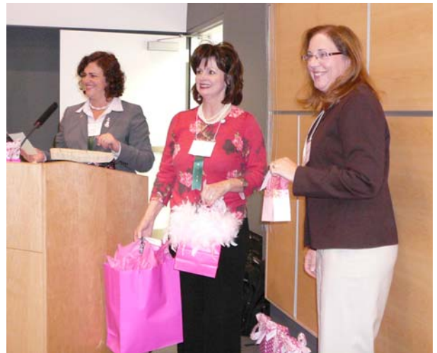
Aren't door prizes great?