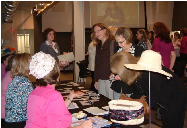
Check in is always a busy place!