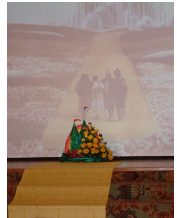
Off to see the wizard... what a grand start to the year!