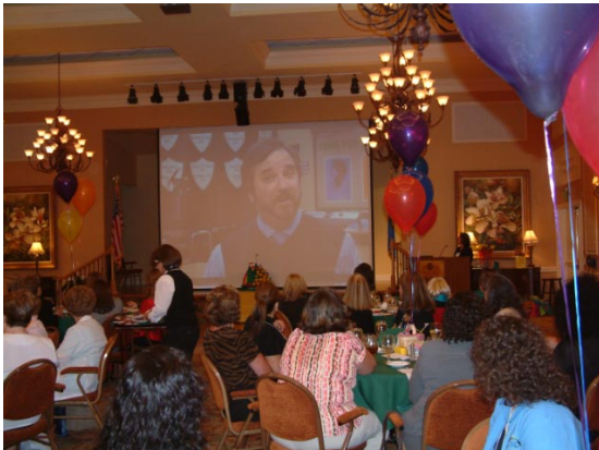
Post business meeting, we watched a video on upcoming BEF speaker, Rafe Esquith.