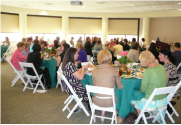
Dinner at the Natalie Building