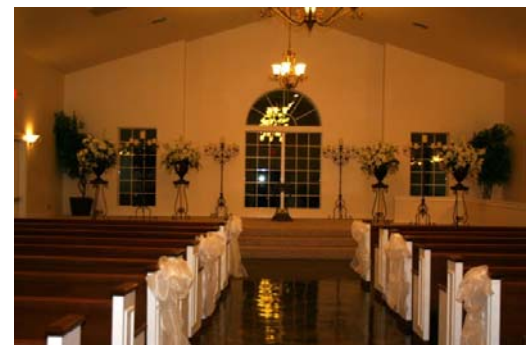
Meeting Site Bella Gardens Wedding Chapel and Banquet Facility.