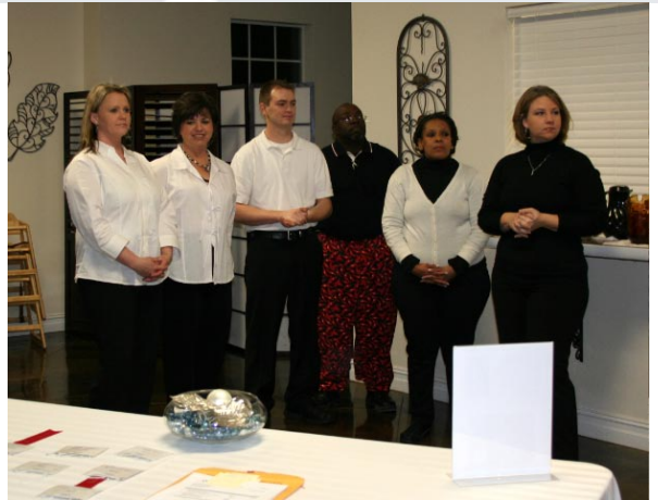
Gateway staff cooked and served our delicious meal.