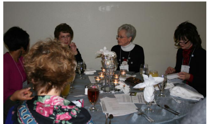
Some deep discussion going on here, prior to the start of the business meeting.