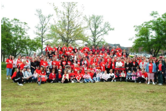
Last year's Saint Francis team, an EWI member firm.