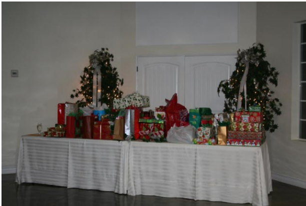
The gift table.