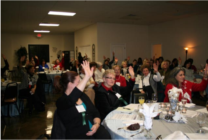
Down to the business of voting.